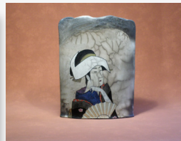
Mary Ichino Vase